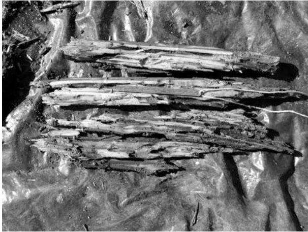
Figure 3: A galleried mangrove log broken up to expose the interior. Rule shown is 15 cm.

sequent visit to the site (February 2000), the pool was completely dry and an additional 13 fish were found inside a different 5-cm-diameter log (Taylor et al. 2004).