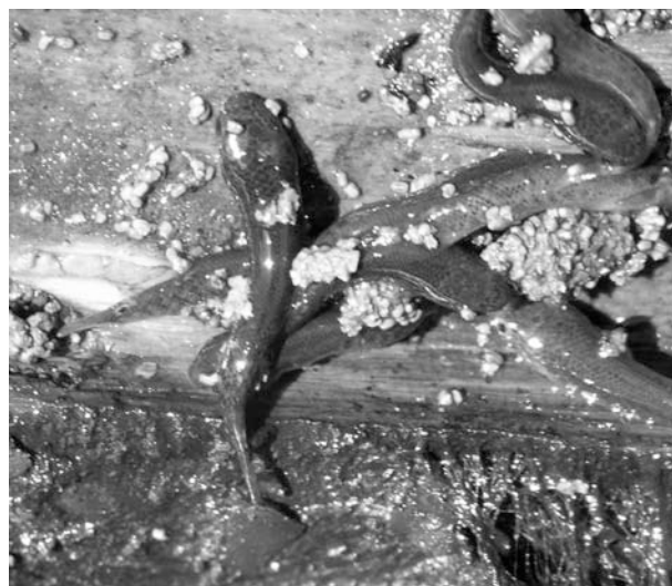
Figure 2: Several fish exposed when a galleried log was broken apart. A video showing a log from Big Pine Key, Florida, as it was being slowly “dissected” open is available in the online edition of the American Naturalist .

The first instance of this behavior was documented on the Belize Cays (Peter Douglas Cay), where in January 1991, we encountered a small drying pool (8 m × 3 m) in which at least four fish species (poeciliids/cyprinodontids) were stranded and dying (fig. 1A). We removed a 1.5-m-long log with a diameter of 9 cm from above the water line and on breaking it open discovered many K. marmoratus inside. The fish were packed heavily inside the galleried log, which remained quite moist in spite of being well above the water line. Fish were immediately active on being exposed, either flipping away from the log or attempting to enter deeper into the galleries. Ultimately, about 100 fish were collected from this log. During a sub-